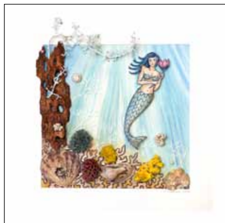
Victoria Yurkova, Tales of a Coral Reef, mixed media