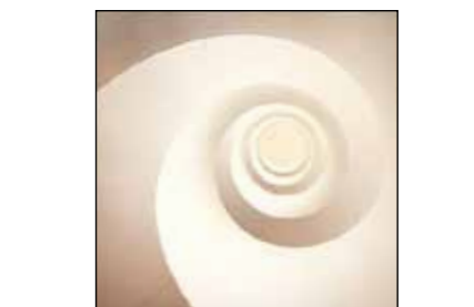
Geoffrey Howe