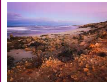
Alexy Aleshin, Little Dip Conservation Park , photography

Sea creatures are also well depicted including fish, birds, crabs, insects and more. Come and enjoy a number of different art forms represented such as pottery, sculpture, paintings, mosaics, jewellery, woodwork, prints, textiles and glass.