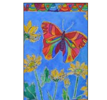
Margie Goodchild, Butterfly & Yellow Daisies