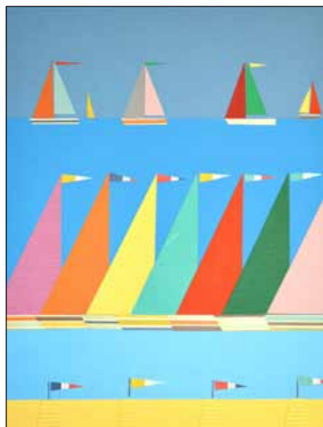
Tim Jones, Sea Breeze, collage