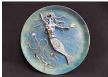
The Iron Canvas, Mermaid, found objects