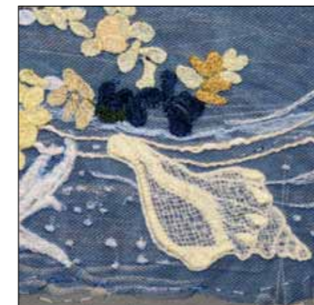
Alvena Hall, Coral Beach #4 (detail), textile