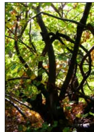
Tree of Light, Photograph

An exhibition of mixed media by audrey emery 2 - 23 June