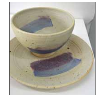
Mel Bone-Manser, pasta bowl & plate