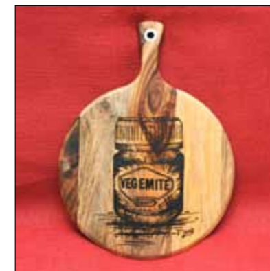
LUNA, Aussie Brekky, Pyrography

An exhibition featuring an assortment of affordable handmade art and craft gifts, celebrating the start of the festive season. Greeted by one of our friendly volunteers, once here, your eyes will be drawn across hundreds of beautiful and unique items by over 50 artists in this treasure trove showcase.