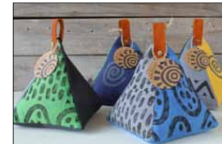
Anita Russell, doorstops, mixed media

This is an exclusive approach to bringing you gallery quality at affordable prices. Whether it's stocking stuffers or precious jewels for that special someone, Little Treasures will have it.