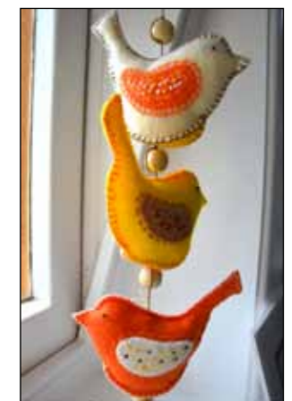
Jenny Fyffe, felt birds