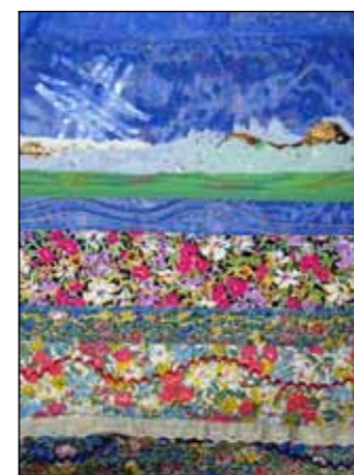
Bev Bills, fabric collage, stitched (detail)