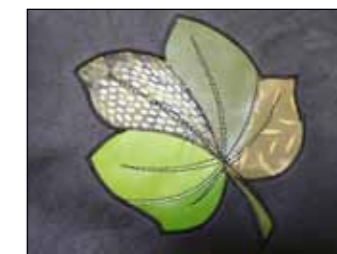
Yvonne Twining, Wild Fibres , inset leatherwork decoration (detail)

The group enjoys exhibiting together and building on diversity of skill and experience. Their mediums include weaving, spinning, basketry, stitch, printing, papermaking, felt, machine embroidery, leatherwork and other various mixed media. Visitors are encouraged to try and spot the ways gold has been incorporated into many of the pieces.