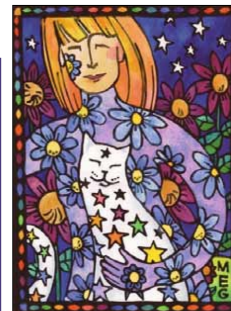
Margie Goodchild, Soul Garden , printmaking

well as many domestic cats. Visitors can expect to see a wide variety of artworks including paintings, jewellery, printmaking, sculptures, textiles, ceramics, pastels, and more.