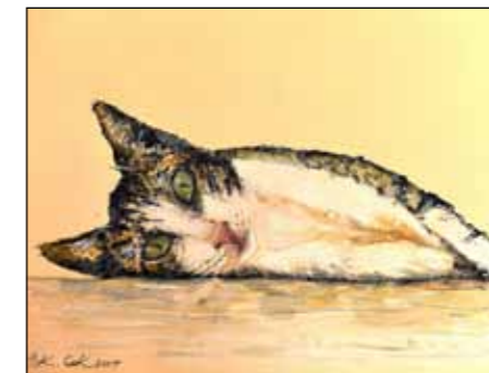
Ines Cook, Little Giuci , mixed media

Catsanova is a quirky, fun and entertaining mixed media exhibition of artworks by more than 30 local artists, inspired by the feline theme. This exhibition will appeal to the cat lover in all of us and will include depictions of both big cats, such as lions as