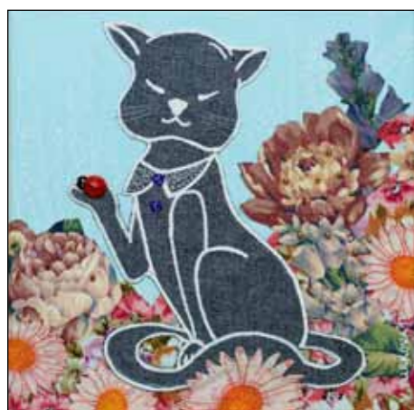
Victoria Yurkova, Princess Of The Spring , mixed media