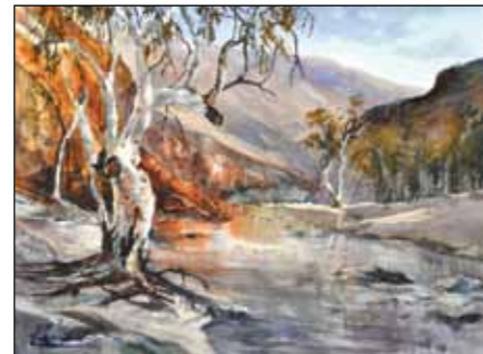
Alan Ramachanden, Ormiston Gorge , watercolour