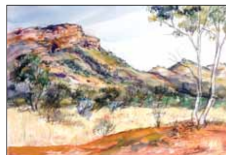
Lyn Robins, Desert Park, Alice Springs , mixed media