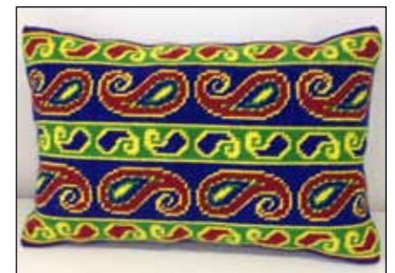
Jane Bakewell, tapestry cushion