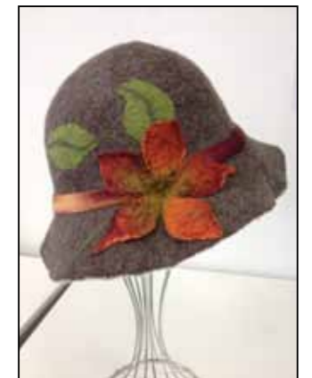
Iris Woolcock, felted hat