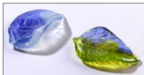
Lorry Wedding-Marchioro, Lucid Moments