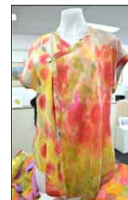
Helen Moon, silk painted top