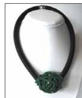
Ursula Goetz, Industrial Chic #2