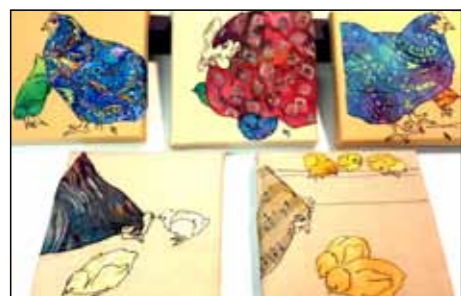
Rosi Gates, textiles, mixed media