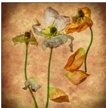
Geoffery Howe, Papaver Exanimus