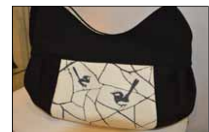
Lyn Schubert, bag