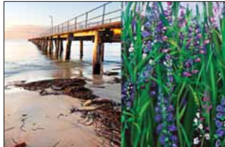
Dave Underwood, First Light; Karen Windle, Wildflowers at Basket Range

Dave Underwood & Karen Windle 4 - 25 September