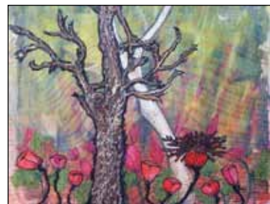
Maxine Fry, Old Gum Trees (detail), Textiles