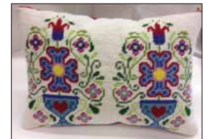
Jane Bakewell, tapestry cushion