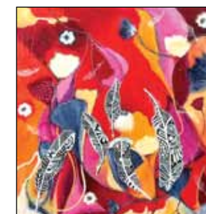
Helen Sidoryn, Pluma , acrylic and pigment pen on canvas