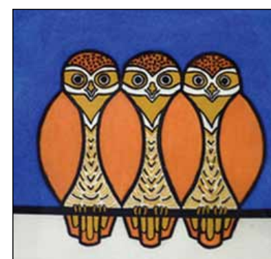
Vicki Hunter, Birds of a Feather Flock Together , printmaking