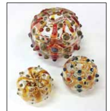
Veronique Southan, Sea Urchins