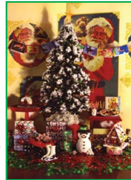
Thea Blake, Merry Christmas

Get ready for Pepper Street's annual Christmas Exhibition to meet all your gift needs and wants!