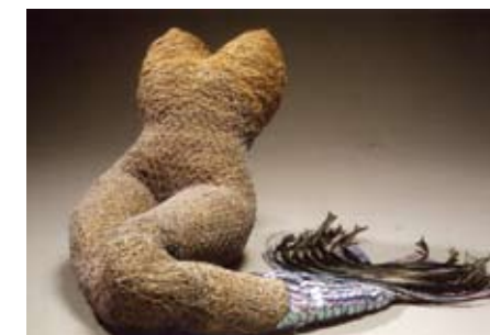
She Fishy, Marlene Thiele, mixed media

1 - 27 March 2009 A Fringe Festival exhibition of artworks with a nautical theme