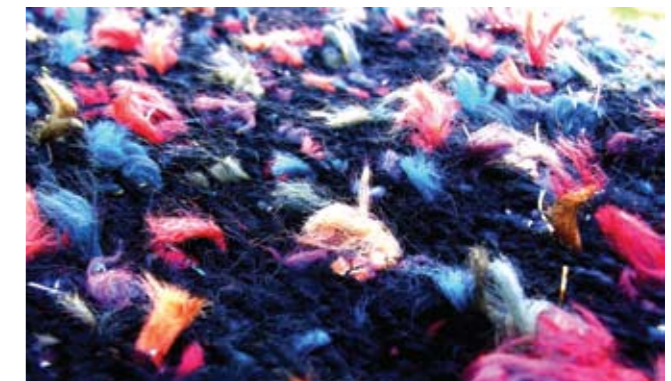
Bev Bills, Arms Through Shawl

An Exhibition of textile works by Wild Fibres