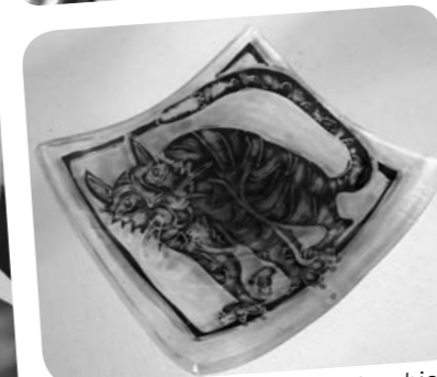
Glass, Lorry Wedding-Marchioro