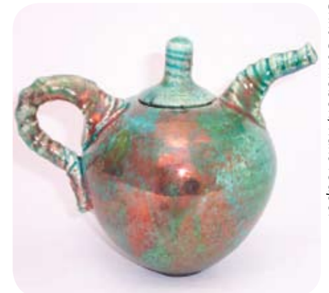
Chris Gurtheben, Raku Teapot

December opening hours: 10.30 am - 5 pm until close of exhibition