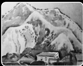
Dorrit Black - Hillside at Queenstown, Tasmania, 1949,

An exhibition of mixed media celebrating 16 years of creativity