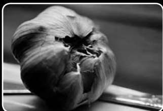
Janine Paris - Garlic

An exhibition of mixed media surrounding this theme