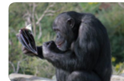
Tessa Morning, Catching up on the Goss

'Connexion' showcases the work of over 60 members, who work in a wide variety of styles. The criteria for exhibition was that all pieces be of a uniform size. Sculptural work in a variety of media, as well as jewellery and textiles, are also featured.