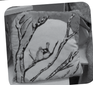
Handpainted Cushion, Trish Loader