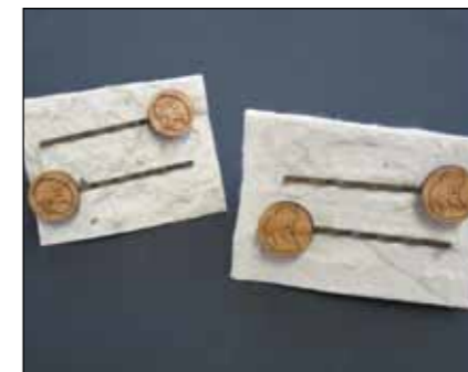
Trish Loader, Hairclips