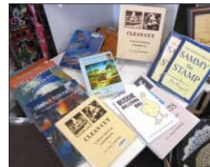
Various Artists, Art Books