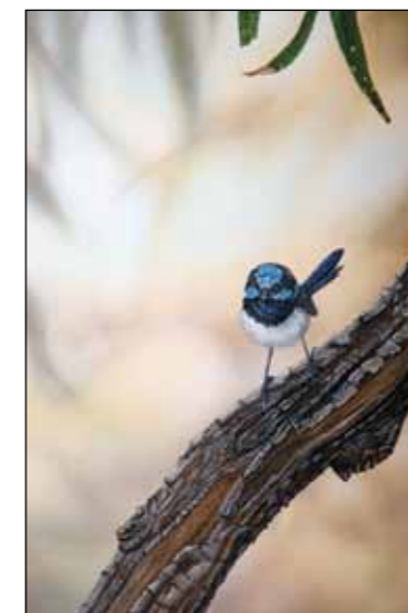
Annette Dawson, Blue Flash