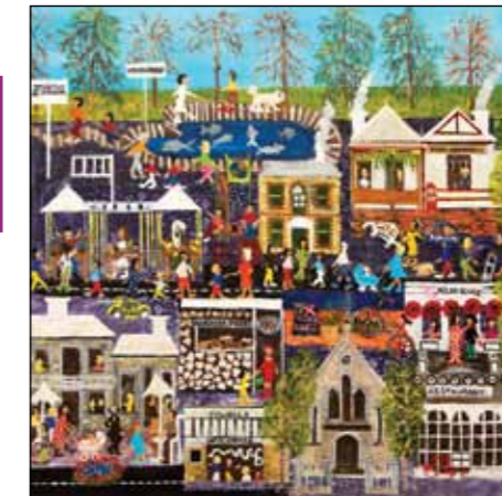
Inta Alander, Stirling #2