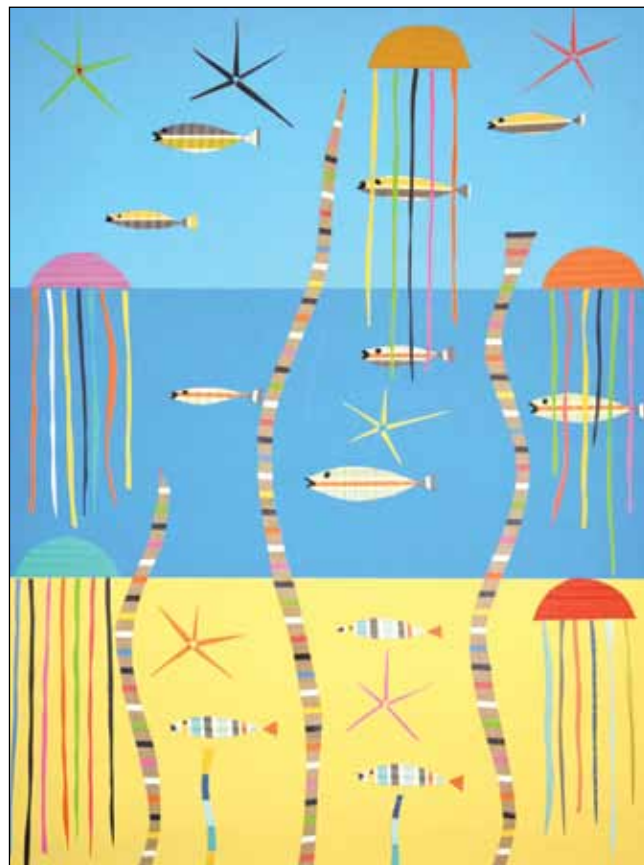
Tim Jones, Sea Creatures , Collage and Mixed Media