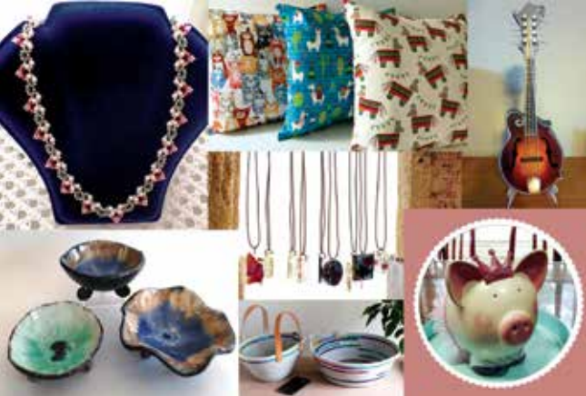
Little Treasures 2019 image collage

Affordable handmade art and craft by over 60 artists 22 November - 23 December