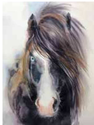
Larissa Rogacheva, Gaze , Watercolour

Adelaide Fringe Festival 16 February - 20 March