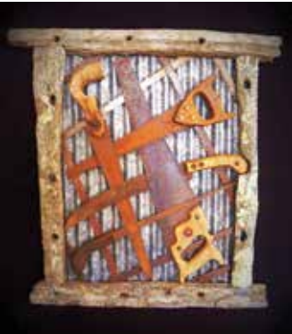
The Iron Canvas, I Saw It First , Mixed Media

South Australian Living Artists Festival 26 July - 28 August