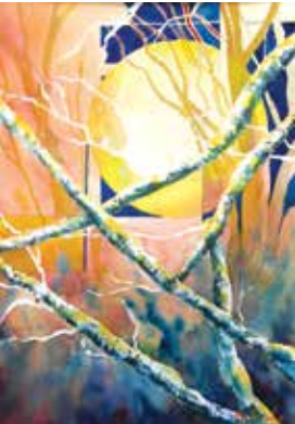
Marilyn Jacobs, Clair de Lune , Watercolour

Artland Watercolour Group 4 - 25 September