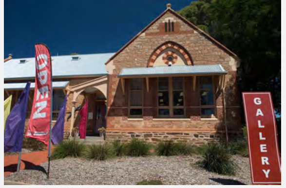
Exhibit in 2017 and 2018

Suitable primarily for 3D work or small scale wall art.