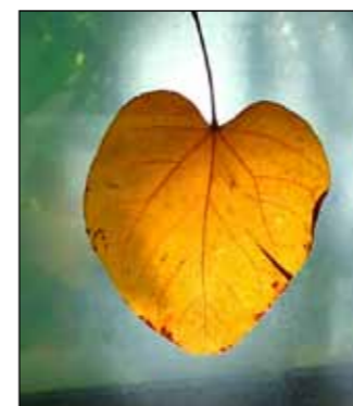
Radiant Heart, Small Installation Leaf