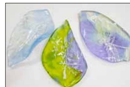
Lorry Wedding Machiuro glass