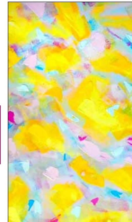
Colour of Light (detail), Painting

Light gives us life on Earth. Sunlight uplifts our heart and inspires hope. radiance is a continuation of audrey's study of the effects of light and nature. In particular a tree in her garden, focusing on the patterns of dappled light and shade under and within the tree as a metaphor for the light and shade in our lives.