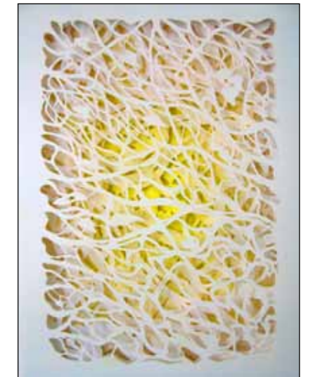
Radiant Complexity, Paper Cut

The artworks explore the transformative power of light, nature and art to inspire a sense of joy, hope, resilience and interconnectedness to each other, community and the environment.