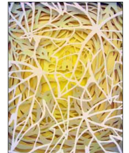
Radiant Light (detail), Paper Cut

Meet and chat with Audrey Saturday 3, 10 and 17 June 2 pm - 4 pm