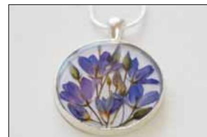
Irina Nazarova, flower pendant