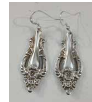
Lyn Robins, upcycled spoon earrings