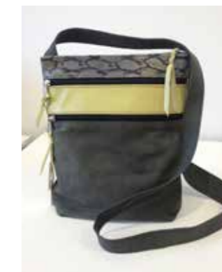
Yvonne Twining, leather bag