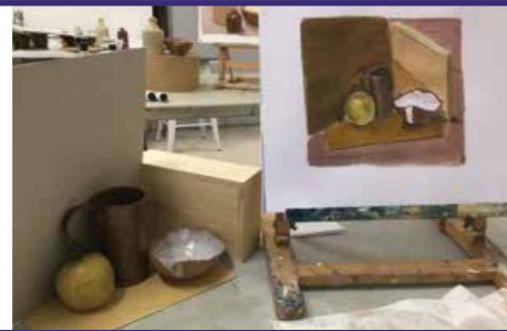
Image: Therese William's Tuesday night class, still life in progress

A range of artforms are available for recreational learning across all skill levels. See inserts in this issue.