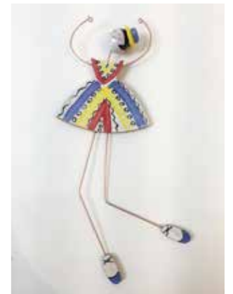
Bunty Parsons, Dancing Girl