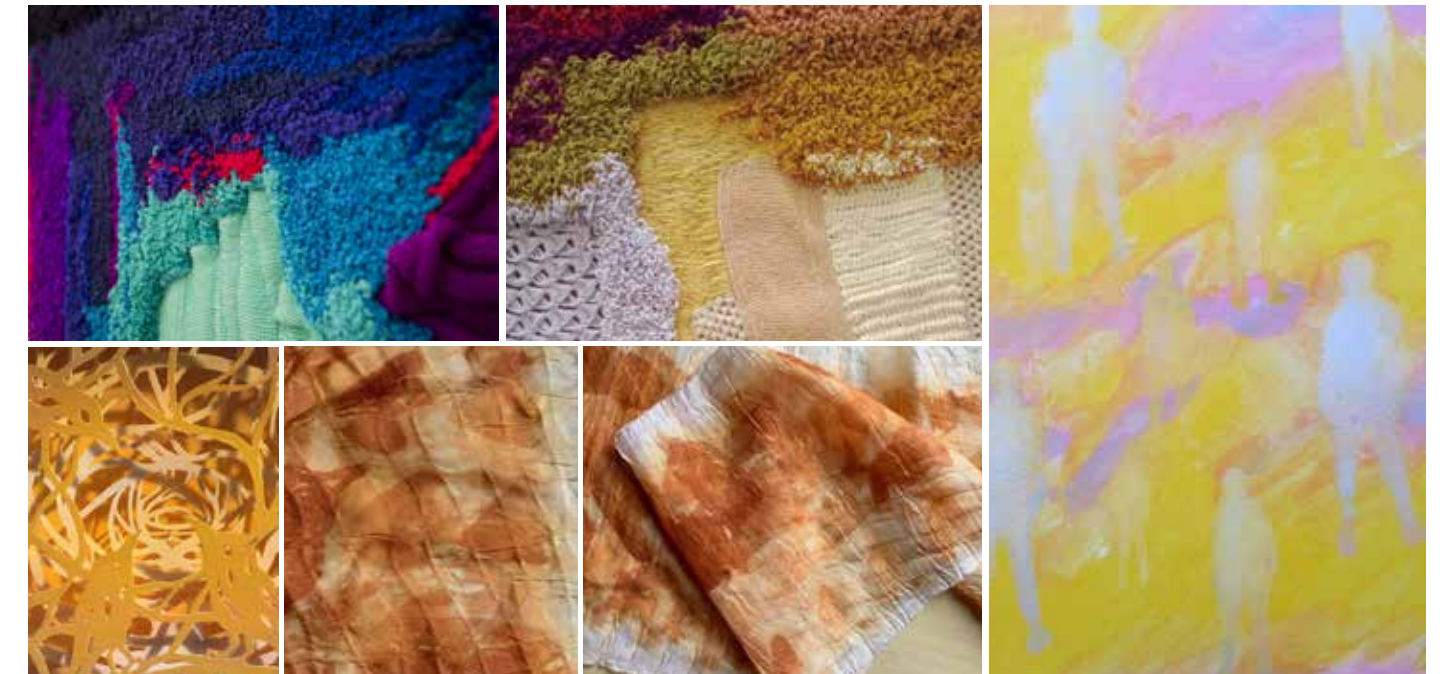
Clockwise L-R: Melanie Cooper, Taste the Floor , Acrylic and Wool on Hessian; Melanie Cooper, Memories of Landscape , Wool and Acrylic on Hessian; Audrey Emery, Light Within , Painting; Lizzy Emery, Impression , Plant Dyes on Silk Steam Bundle; Lizzy Emery, Impression (detail) , Plant Dyes on Silk Steam Bundle; Audrey Emery, Birdsong , Paper-cut, 2020.

An exhibition of painting, textiles and mixed media | 28 May - 18 June