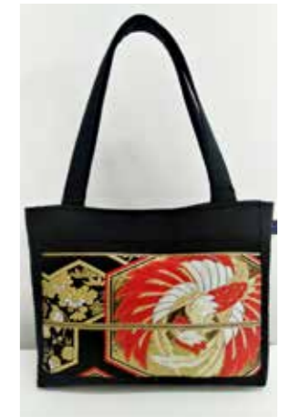
Lyn Schubert, Bag