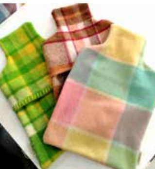
Russell Leonard, Hot Water Bottle Covers