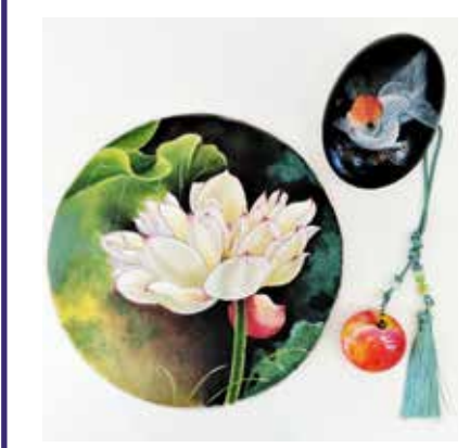
Tanya Zhong, Painted Stones