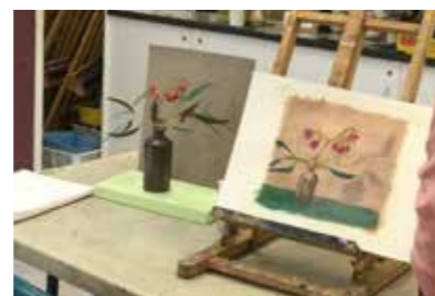
Still life setup

A range of artforms are available for recreational learning across all skill levels. See inserts in this issue.