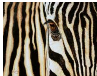
LUNA, Zebra , Acrylic

Accepting 2D and 3D artwork created around the theme of 'wild things'. Artists are encouraged to let their creativity soar. This theme may suggest non-domestic fauna and flora, the use of wild materials, the interpretation of personality, environment, and more! All mediums are encouraged, to be part of this group exhibition with anticipated popular appeal to our community.