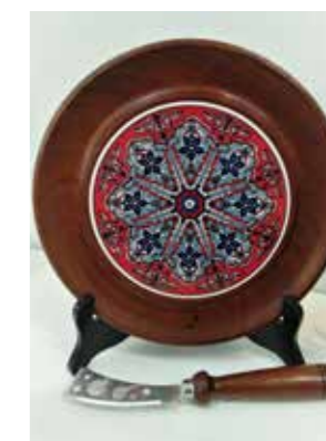
Ron Allen, cheese platter & knife