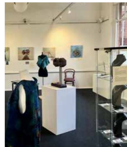
Exhibit in 2024

Exhibition applications for 2024 are now being accepted. Application forms which include information about costs and conditions can be viewed on our website.