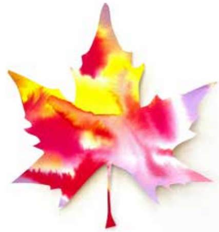
Watercolours and Silhouettes

A range of artforms are available for recreational learning across all skill levels. See inserts in this issue.