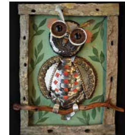
The Iron Canvas, Tex, Mixed Media Found Objects

Accepting 2D and 3D artwork created around the theme of 'Remake'. All mediums are encouraged for the always popular and well attended South Australian Living Artists (SALA) Festival. Artists are encouraged to take their creative thinking to another level, focussing on art making through the reuse, repurposing, recycling and/or upcycling of items into a creative outcome. Guaranteed to entice viewer interest.