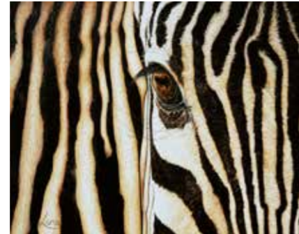
LUNA, Zebra, Acrylic

Where the Wild Things Are - Adelaide Fringe 2023 APPLY NOW