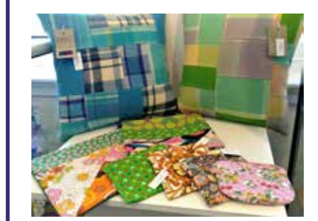
Cindy Choua, Upcycled Purses & Pillows