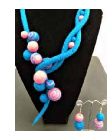
June Short, Felted Neckpiece & Earrings