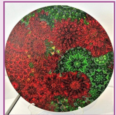
Vera Dulic, 'Poppies'