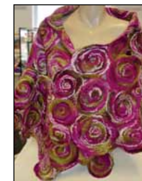
Suzy Gilbert, felted wrap