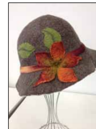
Iris Woolcock, felted hat