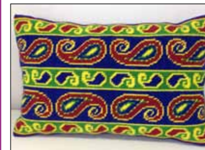
Jane Bakewell, tapestry cushion