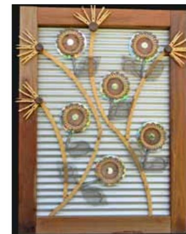
The Iron Canvas, Hang It All Out, Mixed Media

A striking collection of works that celebrate gardens from many viewpoints, including one-off pieces to adorn your own courtyards or garden spaces.