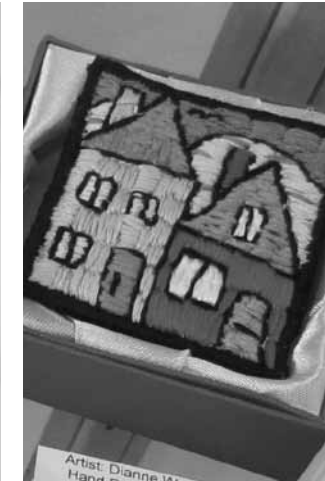
Dianne Wood, Embroidered Brooch