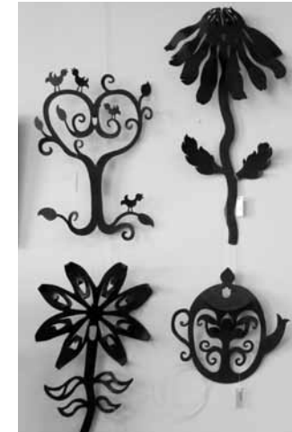
Anna Small, Metal Garden Planters