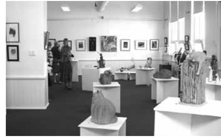
Exhibit in 2014

Applications now being accepted for limited space in the 2014 calendar for artists/groups to submit. Please call for application and details.