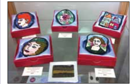
Dianne Wood, Brooches