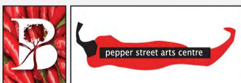
An arts and cultural initiative funded by the City of Burnside

To find out what is coming soon, please view Pepper News .