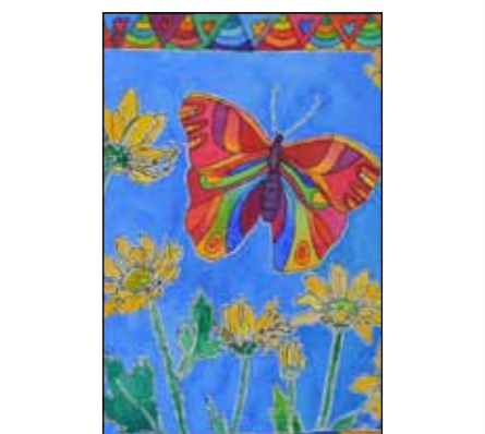
Margie Goodchild, Butterfly & Yellow Daisies