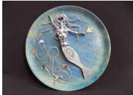
The Iron Canvas, Mermaid, found objects