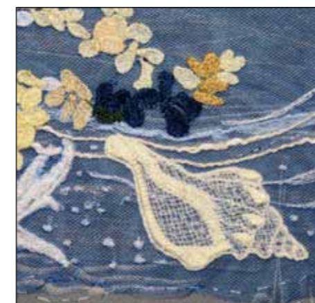
Alvena Hall, Coral Beach #4 (detail), textile