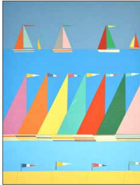
Tim Jones, Sea Breeze, collage