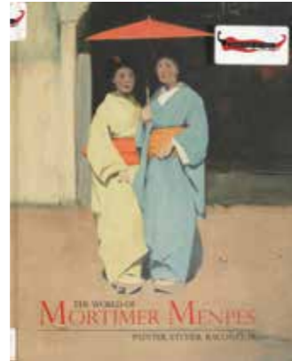
Just one of the popular books for loan: The World of Mortimer Menpes

An exciting collection of art books is available for borrowing or browsing over a coffee at Pepper Street. Provided by the Burnside Library, there are many titles to choose from and they are also a great resource if you are taking classes at the Centre. Any library 'One Card' can be used under the same borrowing conditions.