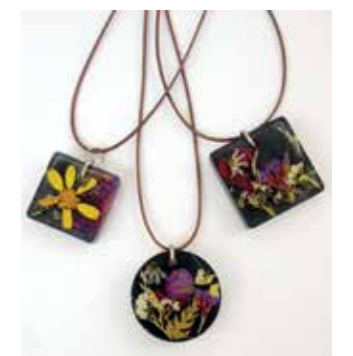
Alice Hu, plants in resin