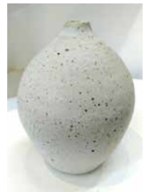
Rosalyn Sachsse, pot