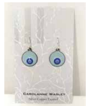
Carolanne Wasley, enamel copper earrings