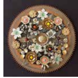
Iron Canvas, Circle of Giving

An exhibition of upcycled, recycled, re-used objects to create something new is open to all artists for the Pepper Street SALA exhibition in 2020. All art forms created around an upcycled, recycled and found object theme are welcome. Applications are now being accepted by the selection panel.