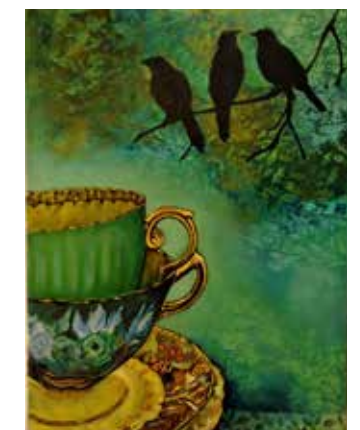
Vicki Niesingh, Last Light, Painting