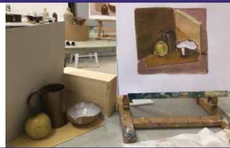
Image: Therese William's Tuesday night class, still life in progress

A range of artforms are available for recreational learning across all skill levels. See inserts in this issue.