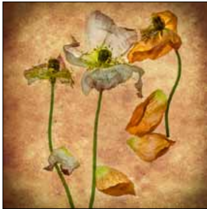
Geoffery Howe, Papaver Exanimus