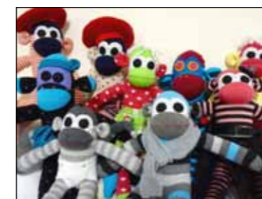
Pseudo Sisters, Mio Monkeys#1

Be the first in the door at the opening celebration to make the most of browsing the wide variety of local artists' work. See hundreds of beautiful items by over 50 artists.