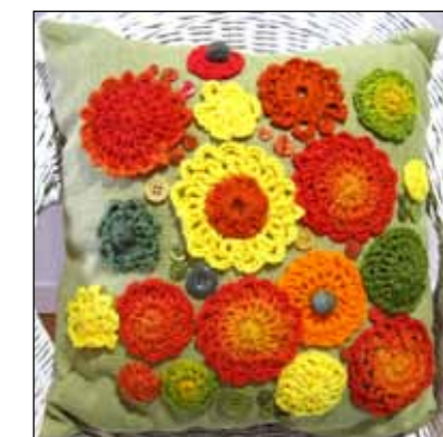
Jenny Fyffe, Cushion

bags, sculptures, toys, greeting cards, wall art, ceramics, glass and more. This is a unique approach to bringing you gallery quality at affordable prices.