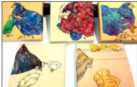
Rosi Gates, textiles, mixed media