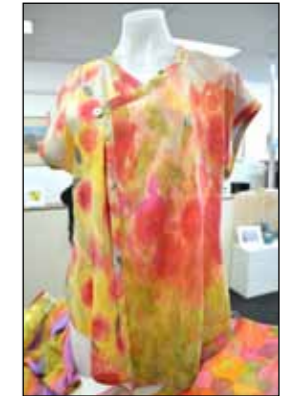
Helen Moon, silk painted top