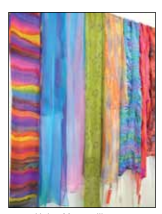
Helen Moon, silk scarves

Try us for your next gift need, or for something special for yourself.