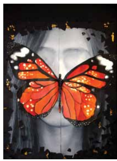
Ellen Baldock, Monarch , digital and acrylic on canvas