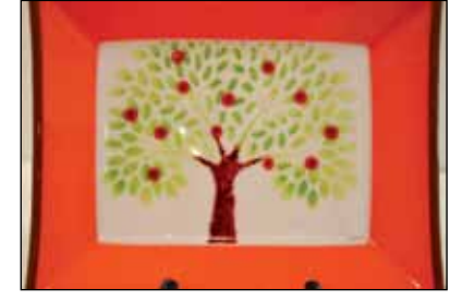
Ivana Di Stasio, glass plate