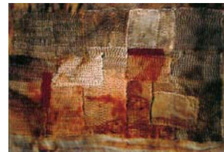
Mem Graham, Contemporary Boro #1