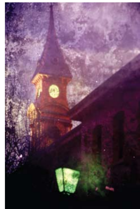
Kathy Harrison, Clock Tower

An Exhibition of Photographic Art 'Seven Up' explores both film-based and digital photography. The processes and techniques on display include black & white, colour, experimental film, macro and infrared photography.