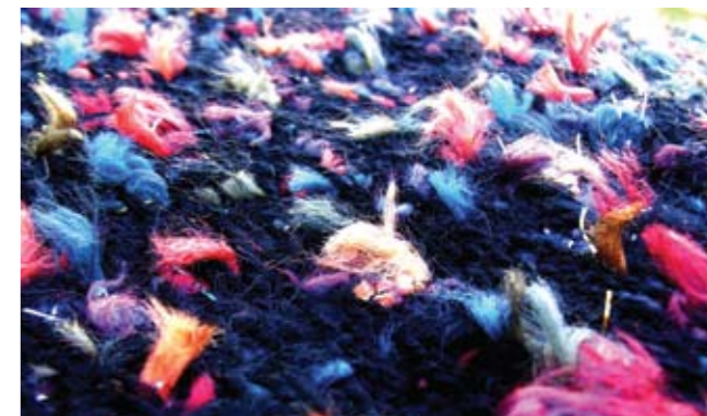
Bev Bills, Arms Through Shawl

An Exhibition of textile works by Wild Fibres