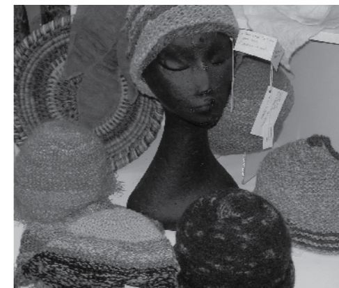
Beanies & other Woolies from $25