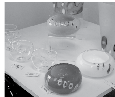
Gorgeous Glass from $18