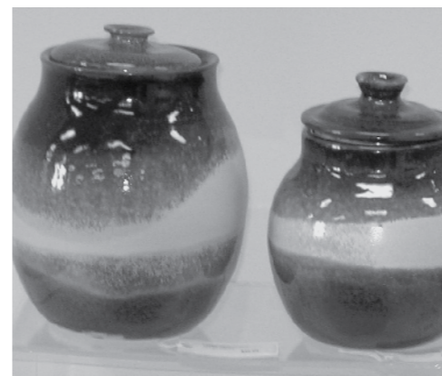
Quality Ceramics from $9