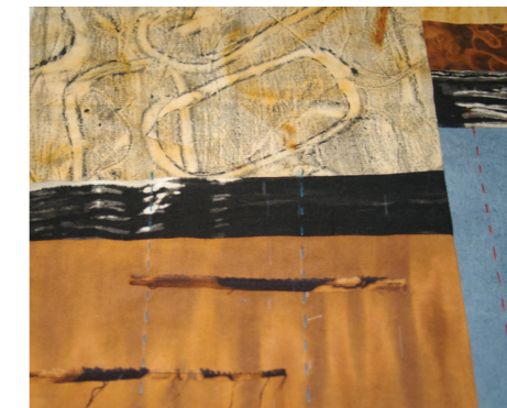
Pat Gebler, textiles detail

An exciting exhibition of artworks from the graduates of Marden Senior College - (Certificate IV in Visual Arts and Contemporary Craft) showcasing an eclectic mix of textiles and paintings.