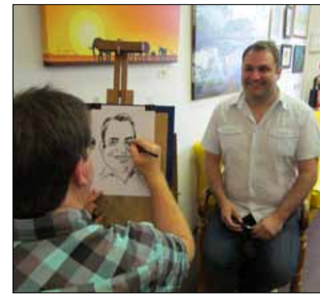
Little Treasures Launch