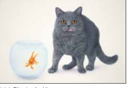
Help!, Elise Leslie-Allen

This exhibition will appeal to the cat lover in all of us, with depictions of big cats such as tigers, cheetahs and lions as well as domestic cats.