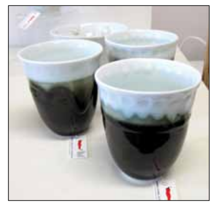
Ceramic Beakers by Tamara Hahn