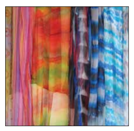
Silk Scarves by Helen Moon

Gallery quality, affordably priced, hand crafted and unique gifts. Try us for your next gift need, or for something special for yourself.