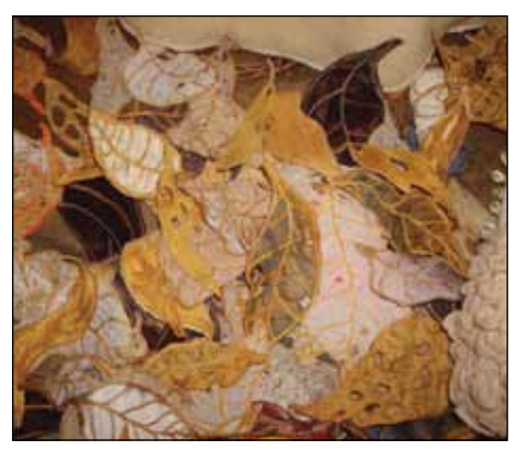
Francie Mewett detail

Students have produced a related body of work, each with their own chosen theme. Personal journeys are revealed and stories are told, often with wit and humour. Experimenting with new techniques, students have pushed the boundaries of traditional textile art and mixed media beyond the conventional. Artworks include installations, 3D pieces, paintings, wearable art, fabric collages and contemporary abstract wall hangings.